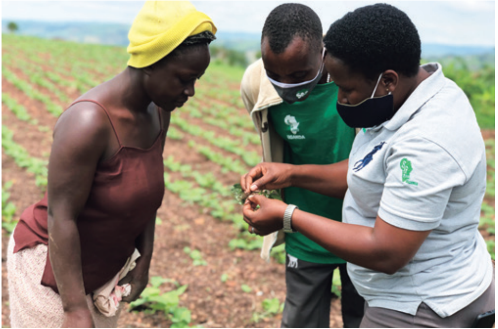
SAA Program Officer with an extension agent examining a plant in a farmer's field in Isingiro District, Uganda