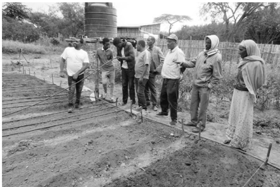
Training on drip irrigation system installation at Gubta Arjo, Ethiopia