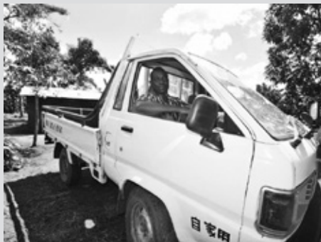
Better agricultural practices enabled Henry to purchase a truck

A story about how good agricultural practices introduced by SAA improves livelihoods