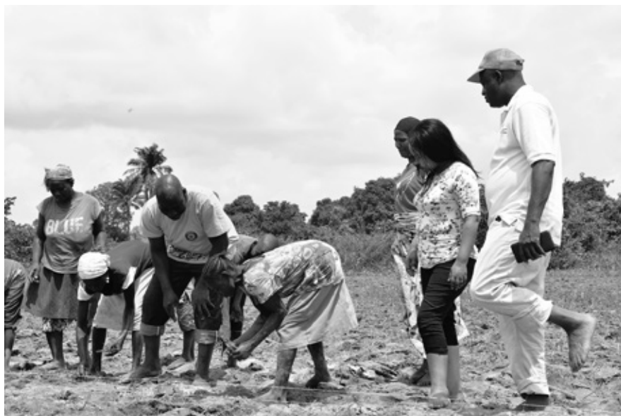
SAA staff working with rice farmers in Nasarawa State, Nigeria

the food-insecure countries of Africa was now, at its (literal) roots collaborative.