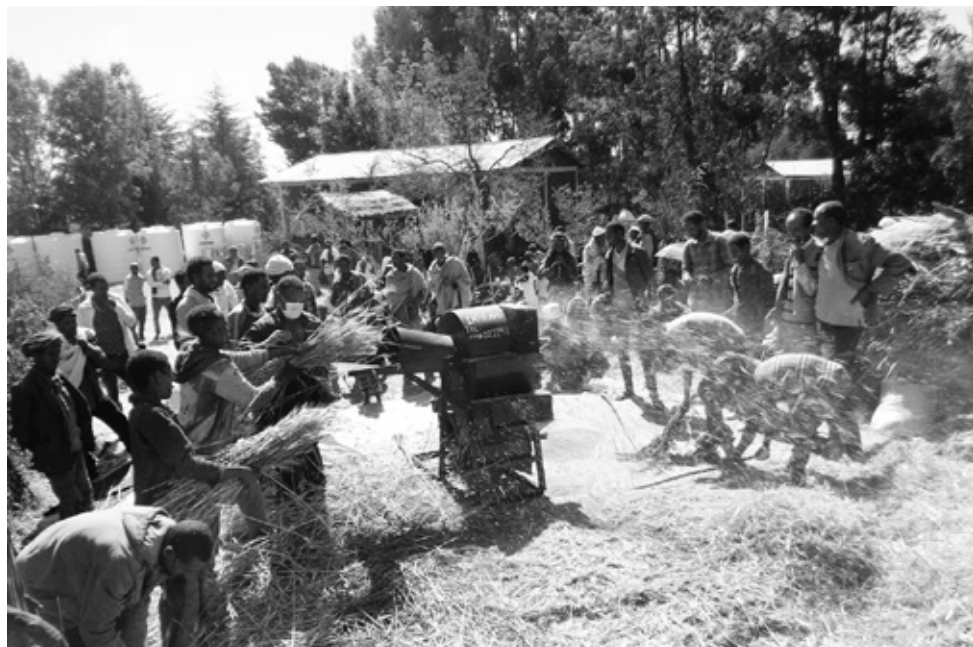
Multi-crop thresher demonstration in a village in Ethiopia