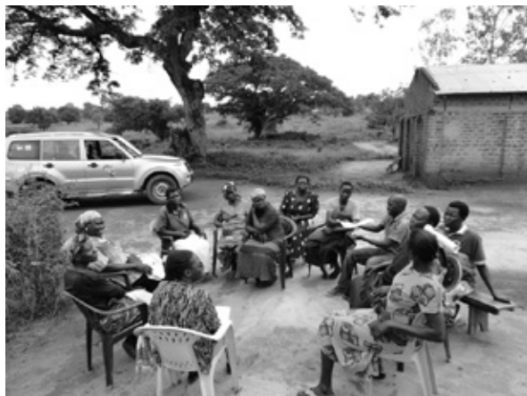
A typical monitoring, evaluation, learning and sharing activity in a village in Uganda

In 2006 SAA decided to correct the problem, working with the Mexico-based CIMMYT to monitor and assess the effects of its programs in Uganda and Ethiopia. A team of social scientists,