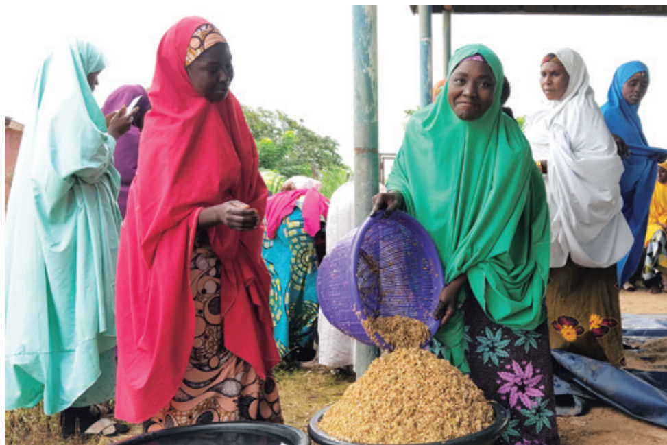
A group of women in Kaduna, Nigeria, cleaning paddy rice for parboiling to enhance its nutritional value