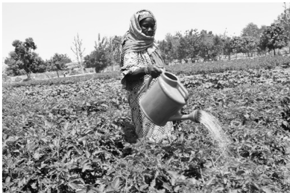
A woman farmer watering tomatoes in her garden in Dacoumani, Mali