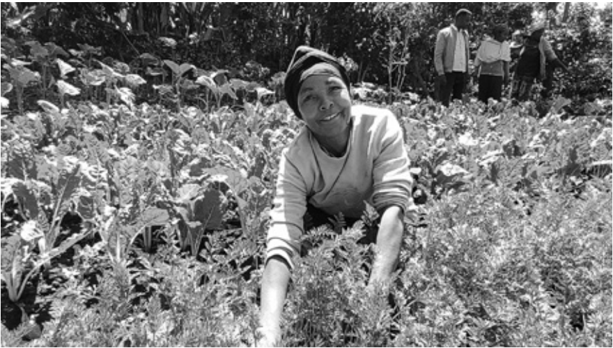
A woman farmer in Ethiopia taking care of her permagarden; it helps improve household nutrition and income

Clearly, worsening malnutrition—and the related, and increasing, economic and social costs—mean that traditional health-related interventions need to be supplemented by a vigorous development agenda focused on food and agriculture. The latter has in recent years been advanced by global declarations and commitments, including Sustainable Development Goals (SDGs). This has led to the emergence and promotion internationally of the “nutrition-sensitive agricultural/food system” concept. At the same time, agricultural