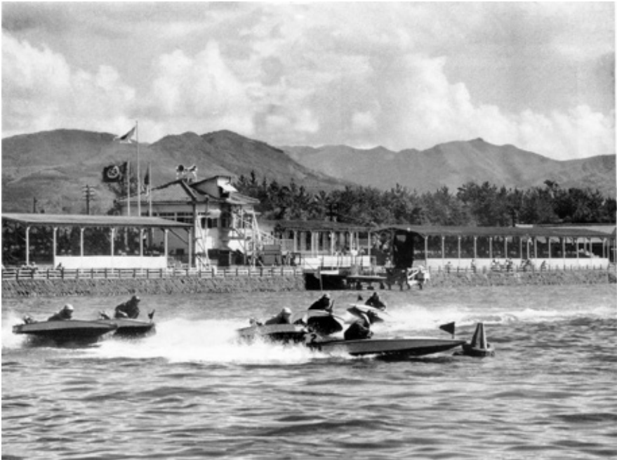
Motorboat racing in 1959

And it proved to be a smash hit. In 1951 Japan passed a motorboat racing law that embodied most of Sasakawa’s vision. Races were organized, crowds gathered, betting started, and money flowed. Sasakawa