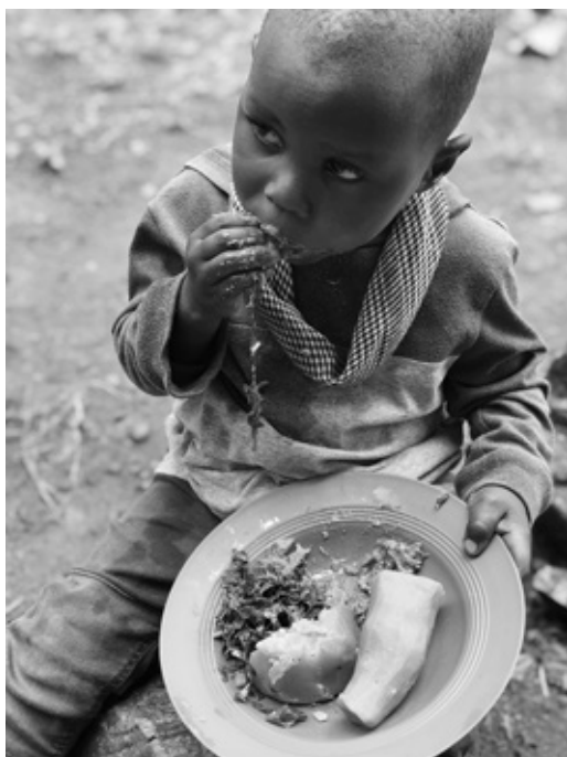
A child enjoying nutritious orange-fleshed sweet potato and vegetables promoted by SAA in Bugiri, Uganda