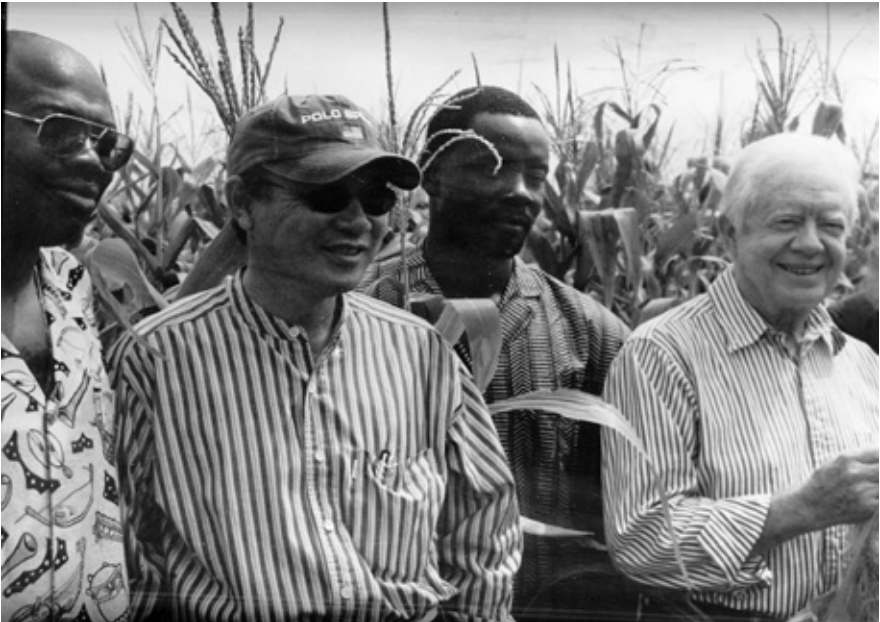
Yohei Sasakawa visiting a field with the former U.S. President Jimmy Carter

It was a remarkable vote of confidence in a program that was, in many ways, still just beginning to get its feet on the ground. The commitment to funding at this critical juncture was a much-needed vote of confidence at a time of managerial and programmatic change. It showed not only that the JSIF would stand by its programs in Africa, but also that it would continue to do so even as the SAA board adjusted to new realities, and the group's responsibilities changed to meet new challenges. In short, it was a sign of flexibility at the highest