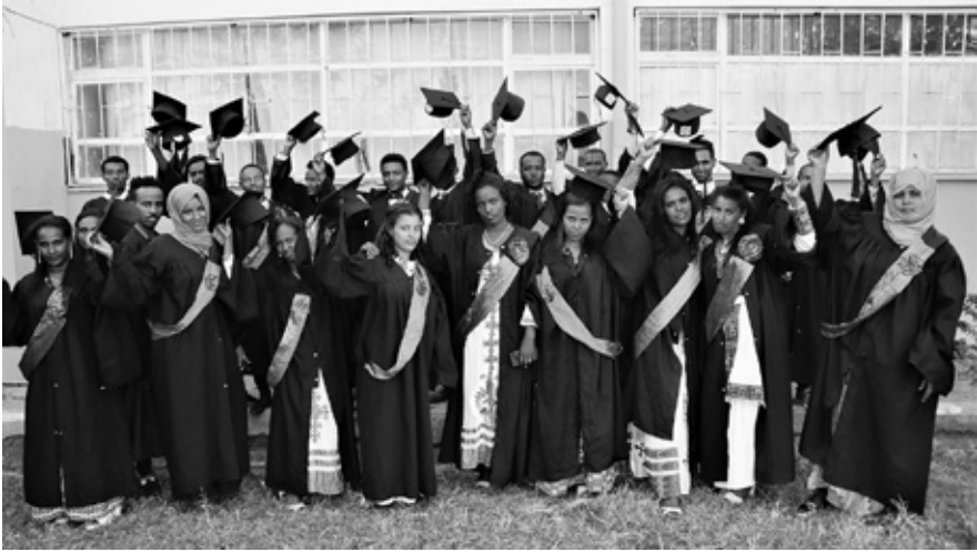
Graduates of the SAFE program at Wollo University, Ethiopia

that multiplied the effects of SAA's support—mostly in the form of seeding programs and ongoing management—by leveraging resources from universities, national governments, private employers, and other nonprofits. Everyone ended up winning, especially smallholder communities benefiting from the highly trained workers assessing their needs and offering support.