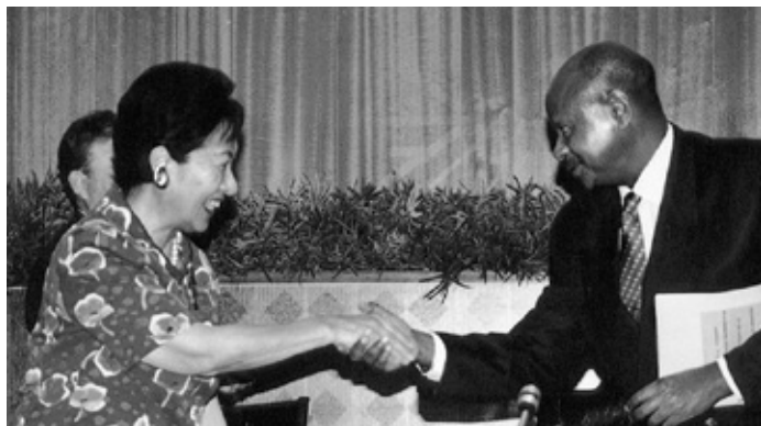
Ayako Sono, Chairman of The Nippon Foundation, greets Yoweri Museveni, President of Uganda, at a 2001 workshop in Kampala, Uganda

But none of these programs had closed as scheduled. Instead, delays in the phased shutdowns and the addition of a number of new programs in new countries left The Nippon Foundation with little choice than to intervene directly in SAA's operations for the first time. It instructed the SAA board to close its projects in Nigeria, Togo, Benin, and Tanzania by 1998.