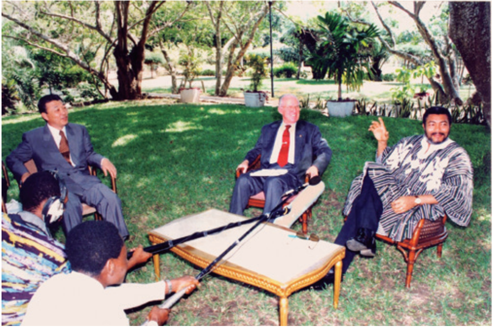
Yohei Sasakawa and Norman Borlaug at a media event with Jerry Rawlings, President of Ghana