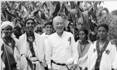
Yohei Sasakawa with women farmers in Ethiopia

Yohei Sasakawa was born in Tokyo in 1939, and at the age of six, he miraculously survived the worst air raid on Tokyo, which is said to have killed over 110,000 people in one night. In 1976, he visited the Korean Leprosy Research Institute