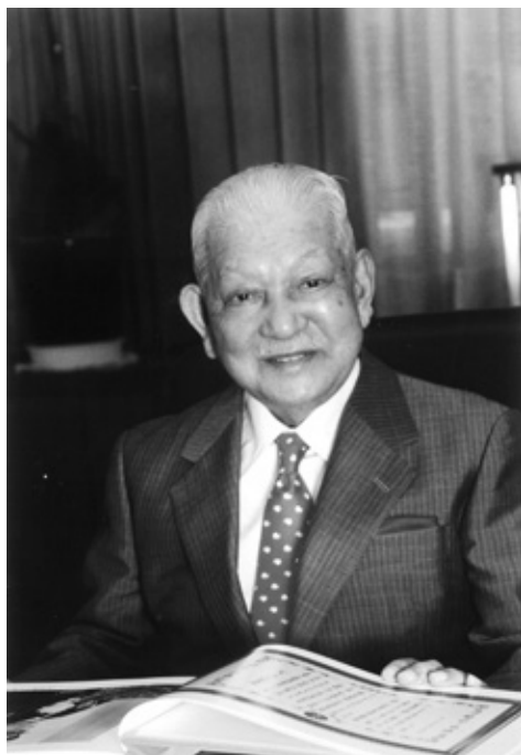
Ryoichi Sasakawa

a small right-wing political party. He became a strong supporter of Japan's entry into World War II.