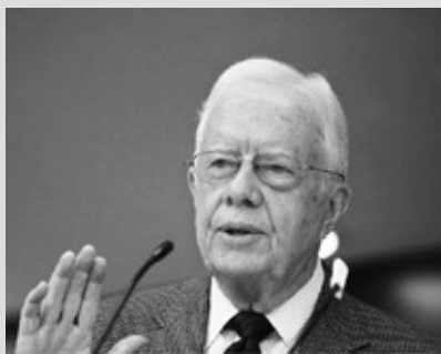
Former U.S. President Jimmy Carter at the Borlaug Symposium, Addis Ababa in 2010

By the time he began to work with the Sasakawa organization in the early 1980s, Carter was a full-time global humanitarian. After leaving the Oval Office, he and his wife, Rosalynn, began their long and direct involvement in Habitat for Humanity, eventually contributing to the building or repairing of more than 4,000 homes in fourteen different countries. He was also devoting his prodigious energies to funding his Presidential library and starting The Carter Center for resolving conflict, promoting democracy, protecting human rights, and boosting health efforts. Ryoichi Sasakawa and the JSIF provided him with much-needed funds. They worked well together, with Carter gaining enormous financial support, and the Sasakawas aligning their organization with one of the world's most renowned altruists. It was the start of a relationship that would help bring Carter into the effort to address food issues in Africa.