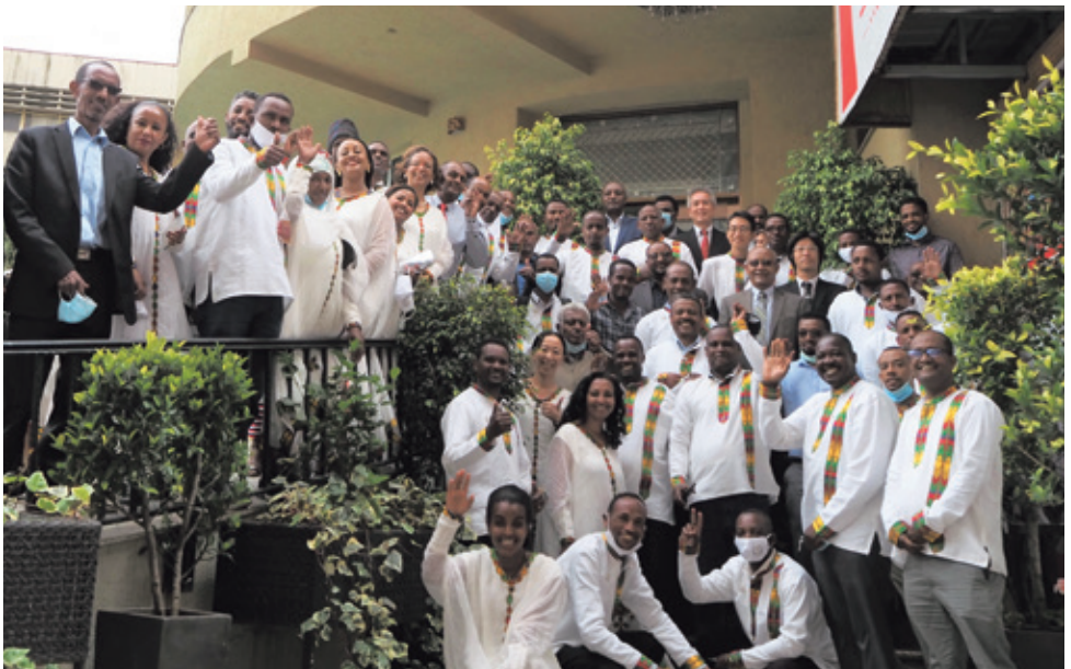
At SAA's 35th anniversary event in Ethiopia in 2021, the SAA President, Country Director and staff enjoyed the occasion with farmers, delegates from the Ministry of Agriculture, and other partners