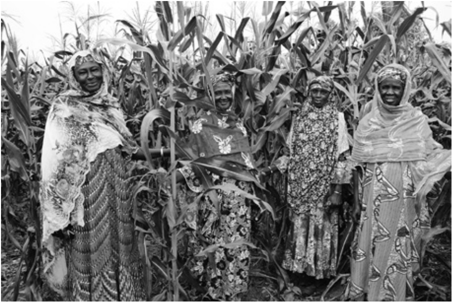
Women host farmers producing an improved maize variety at a demonstration plot, Mali