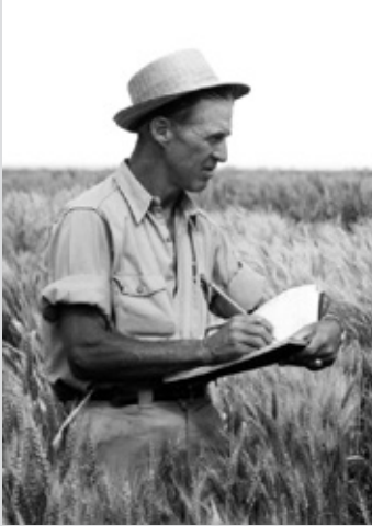
Norman Borlaug at work in Mexico, where he developed high-yielding wheat varieties