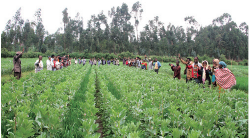
Field day on regenerative agriculture practices (intercropping of wheat and faba beans) in the SNNP region, Ethiopia