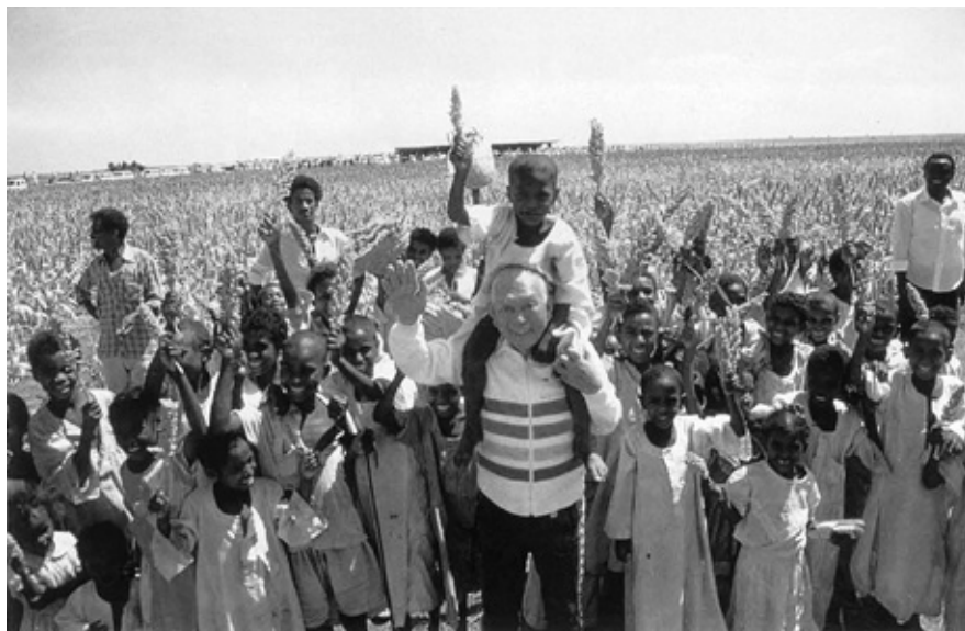
Ryoichi Sasakawa carrying a boy on his shoulder in a maize field

The greatest success story during the early years was Ghana. Jerry Rawlings, despite the blustery first impression he made, proved an enthusiastic partner for the SAA-Global 2000 effort. “Spectacular” crop increases, according to one observer, were grown on an ever-increasing number of demonstration plots in Ghana, from 40 in 1986 to 1,600 in 1987, to 16,000 in 1988. During the next fifteen years, maize production in Ghana would more than double, and cassava and rice production would triple. The full cooperation of the government also allowed the development of support programs for educational outreach, for fine-tuning agricultural requirements for specific soils, and for the development of even better crop strains.