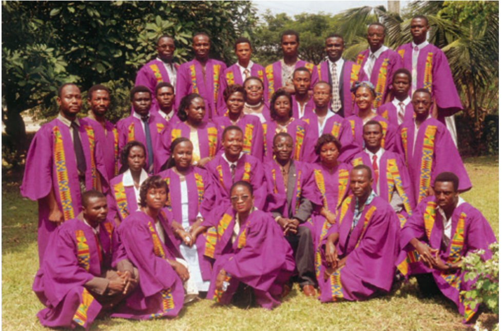
The first SAFE diploma group enrolled at Ghana's Kwadaso Agricultural College