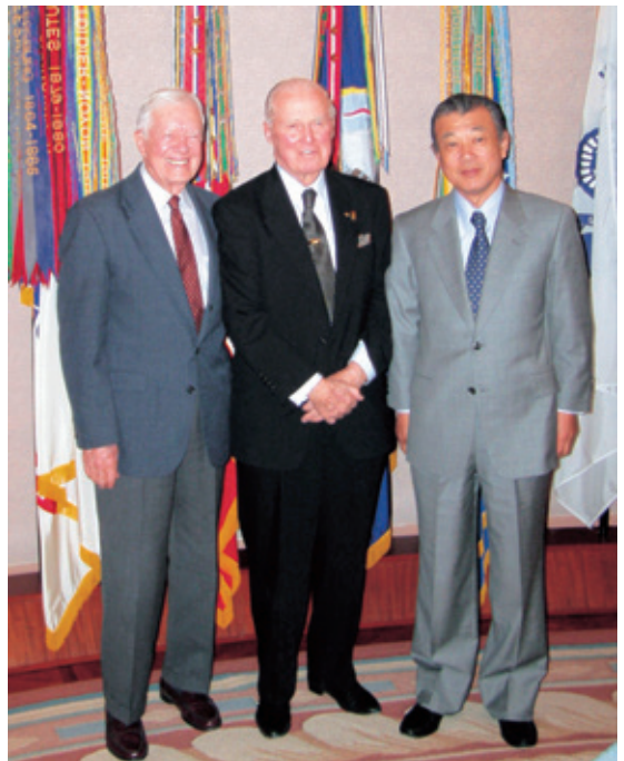
The former U.S. President Jimmy Carter, Norman Borlaug, and Yohei Sasakawa at the Carter Center, Atlanta, Georgia