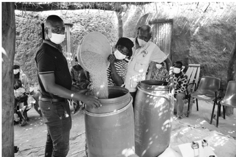
Demonstration of hermetic storage for sorghum that aims to preserve grain quality, at Siranikoto, Mali