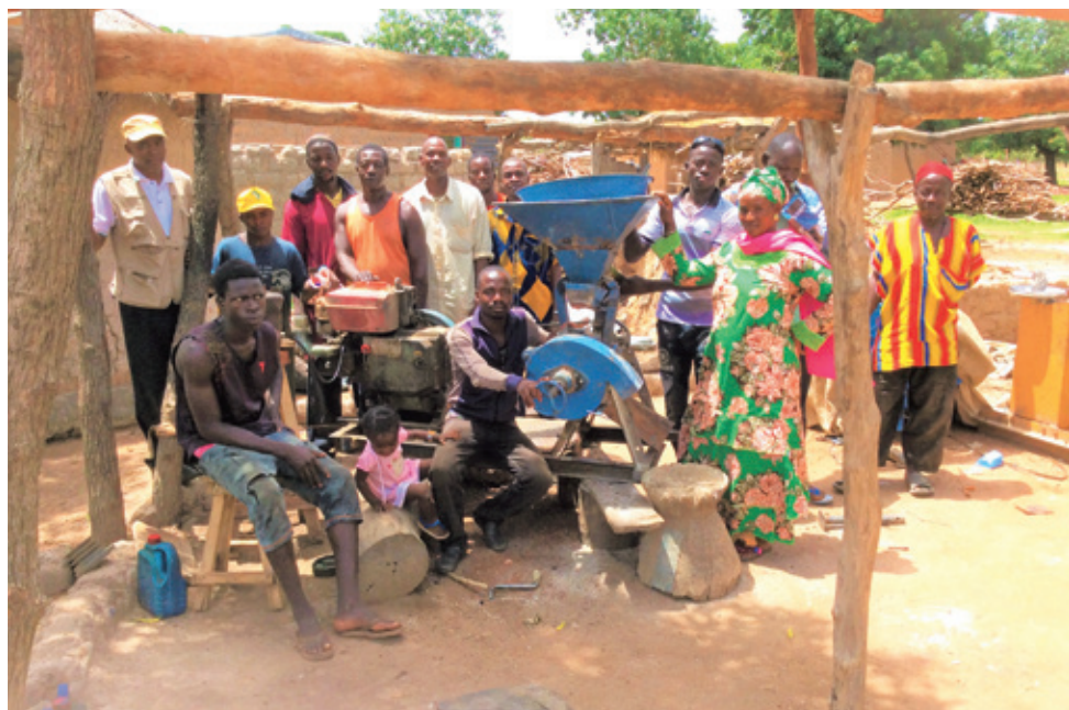
Private service providers with a cereal dehuller in Sikasso region, Mali