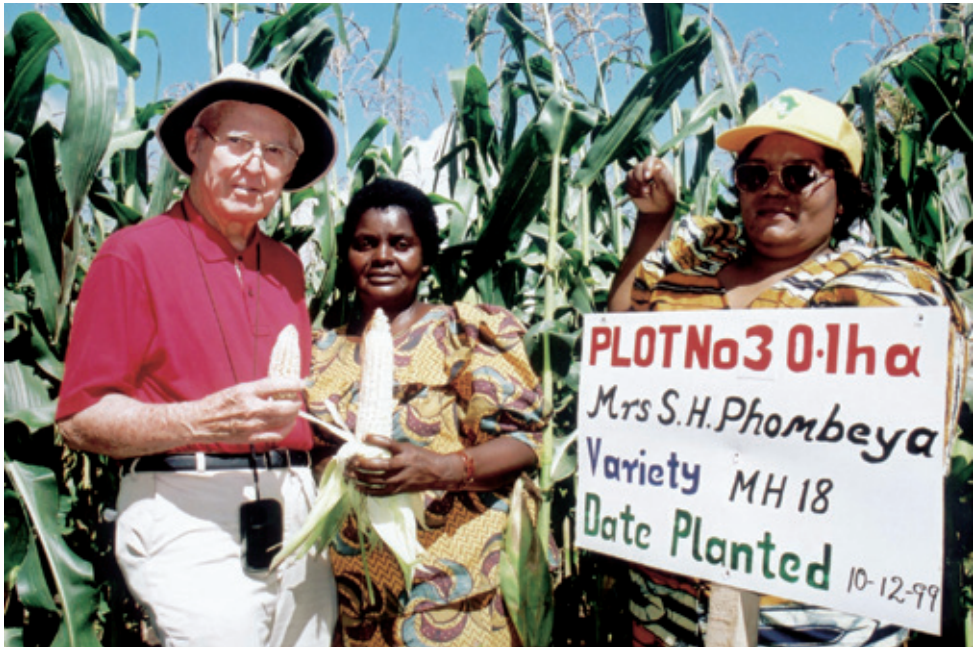
Norman Borlaug with farmers in Blantyre, Malawi