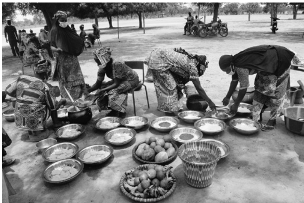
Practical nutrition training for a women's group in Mali